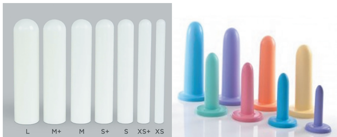
Figure 3. Examples of silicone and hard plastic vaginal dilators in different sizes.

which can lead to dyspareunia and vaginismus symptoms.